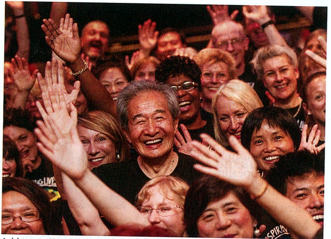
Ashburton Sings community choir members share their voices.

The science of singing is proven to make you happier, healthier and smarter, but the award-winning With One Voice program also focuses on social inclusion and wellbeing, providing a joyful place for people to find their voice, friends and mentors, improve self-esteem, build skills and employability. The choirs are fun and we'd love you to join us! To find out more please visit www.creativityaustralia.org.au